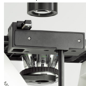
Coaxial control knobs for x/y can be fitted either left or right